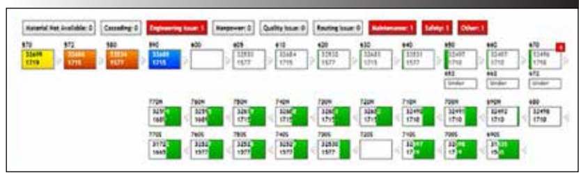
Visual Factory - Visualizing plant floor production movement based on uploaded schedules.